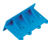
wall bracket Mignon Duplex