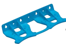
-D- wall bracket