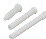
4", 7", 10" diffuser tubes