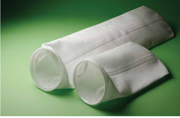
The UNIBAG filter is available in two sizes, two media material and two ring material options.