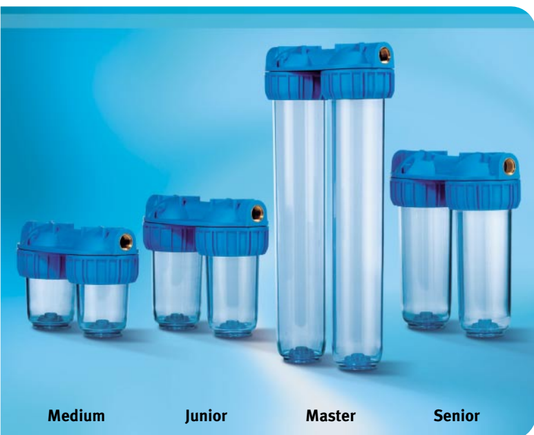
Medium Junior Master Senior