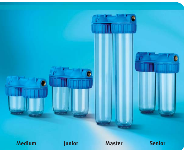
Medium Junior Master Senior